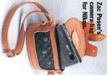
Zac Posen's camera bag for Nikon.

ON TRACK AT NPD: The NPD Group has announced that it will develop its first