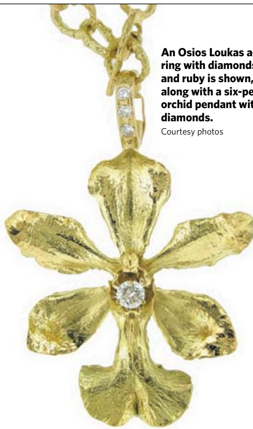
An Osios Loukas acorn ring with diamonds and ruby is shown, along with a six-petal orchid pendant with diamonds.

He discussed a pair of 18-karat white gold dangle earrings studded with diamonds, as well as a magnolia leaf pendant with diamonds set along the leaf's veining.